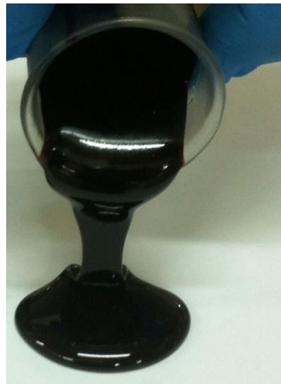
Carbofen 5055 delivery to you in a concentration of approximately 50%

Please read our Safety Data Sheet (SDS) and our Material Safety Data Sheet (MSDS) for detailed information.